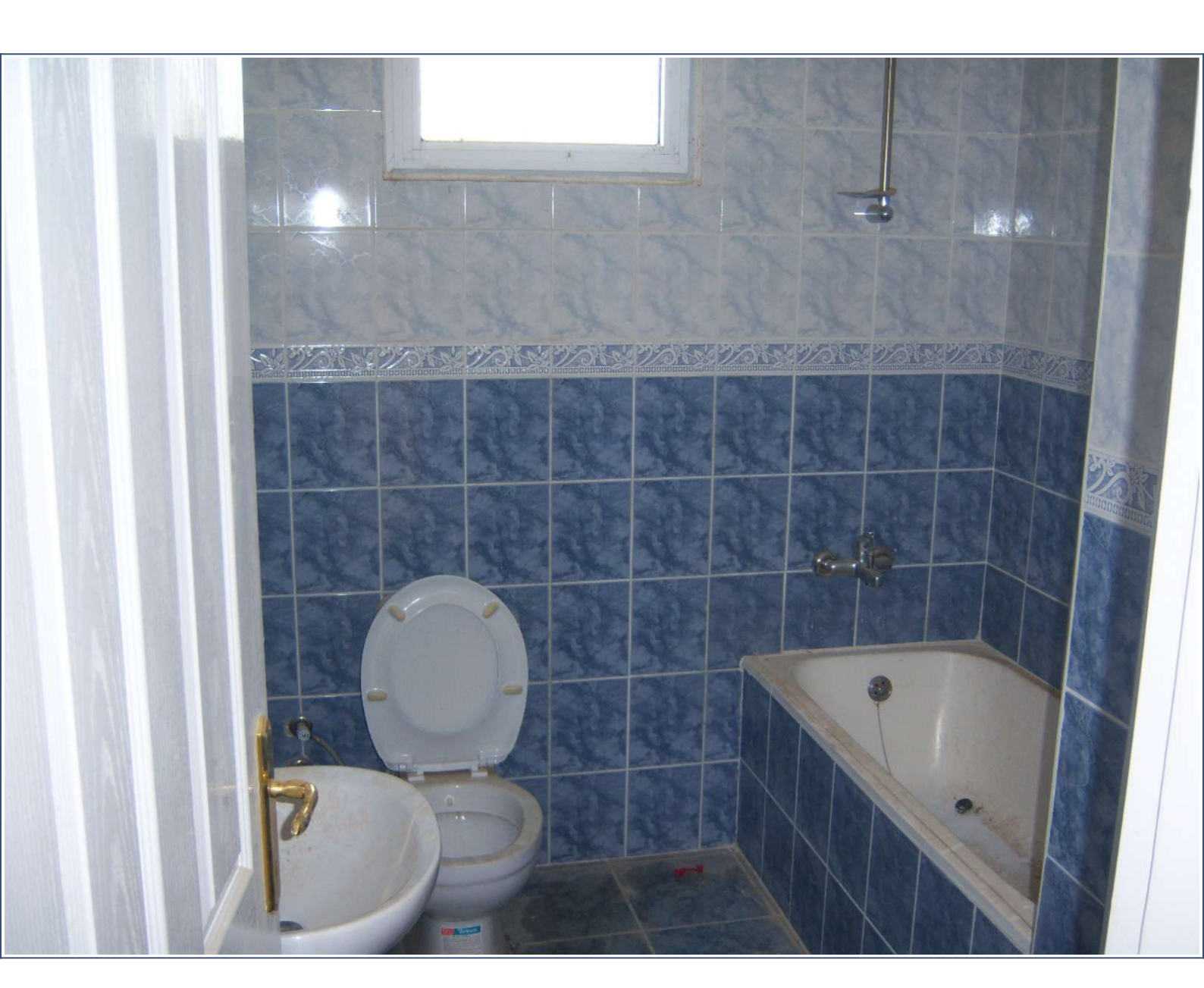
Asking Price: £350